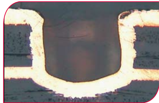
Blind via with standard tool